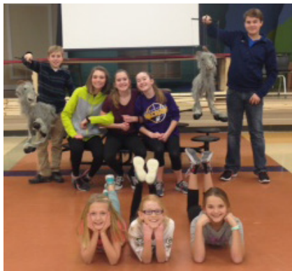
Cast members of this year's The Sound of Music rehearse the song "The Lonely Goatherd".

March 2-5, 2017, Nature Hill Intermediate School will produce, perform and experience a live performance of The Sound of Music . When a postulant proves too high-spirited for the religious life, she serves as governess for the seven children of a widowed naval Captain. Her growing rapport with the youngsters, coupled with her generous spirit, gradually captures the heart of the stern Captain, and they marry. Upon returning from their honeymoon they discover that Austria has been invaded by the Nazis, who demand the Captain's immediate service in their navy. The family's narrow escape over the mountains to Switzerland on the eve of World War II provides one of the most thrilling finales in the theatre.