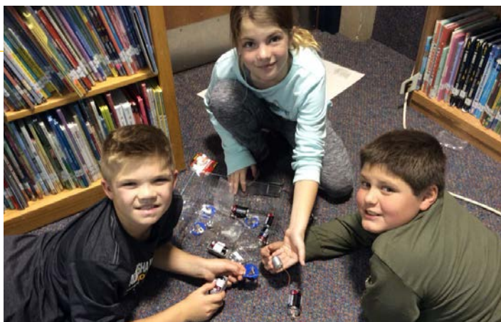
Fourth-graders work on their energy science unit by extending their learning with motors, switches, and propellers.